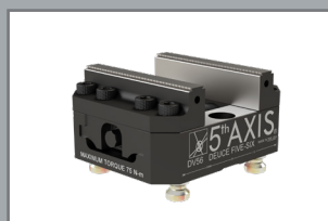
Single Station Fixed Jaw