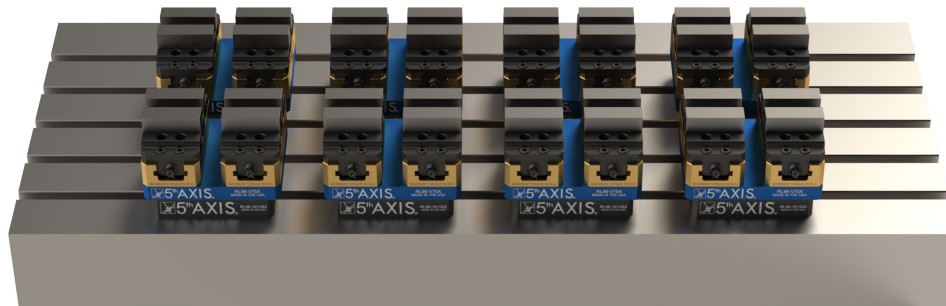
DV75150X-J1 shown on the RL96A-3613S1 base plate

Scan the QR code to learn more about The Deuce Vises. You can also use our 3D compatibility tool to see which products fit your machine.